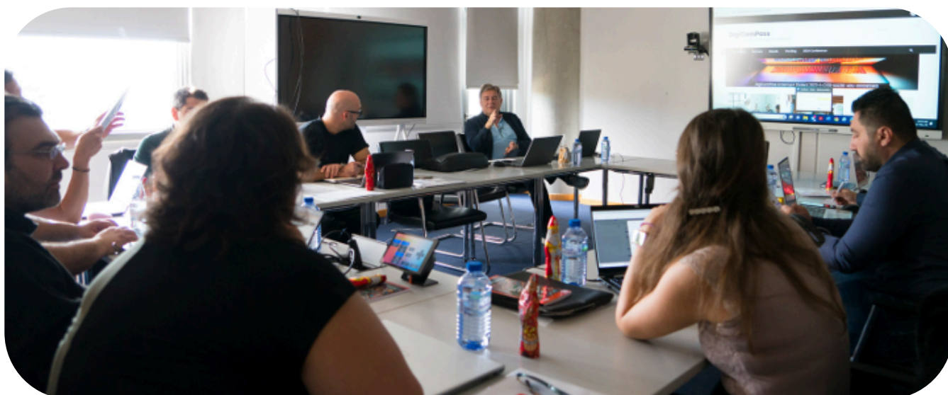
Final TPM in Nicosia Cyprus – Nov. 2024 Partners discussion, final project closure measures.

Through the dedicated form, it will be possible to join and benefit from the research material and scientific papers produced during the two-year project. There is no registration fee for new members.