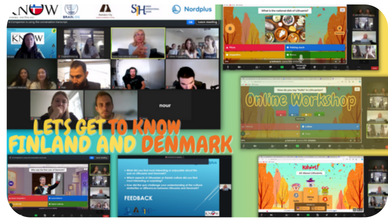
From the online workshop between Denmark and Lithuania